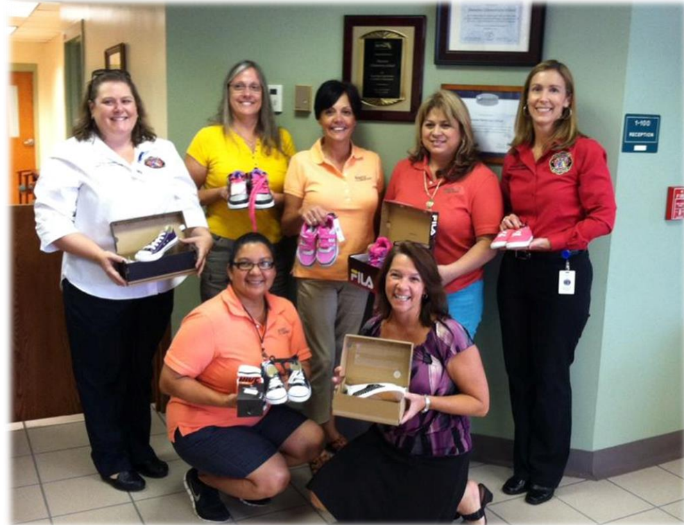
The District delivered over 200 pairs of new sneakers to area schools