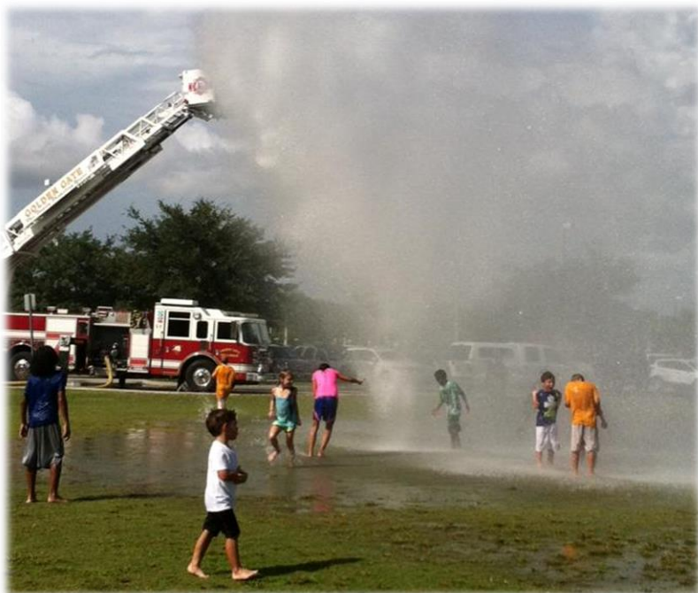
Tower 72 hosed down GG Kiwanis' Run for Fun Participants