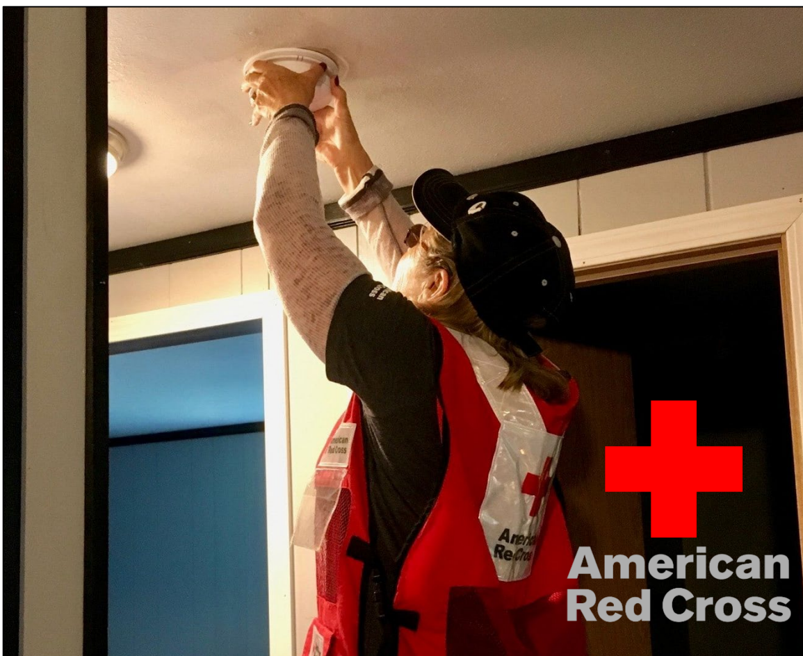
Through the Home Fire Campaign, the American Red Cross has saved 627 lives as of 2019.

The Home Fire Campaign helps save lives by installing FREE smoke alarms in homes that don't have them, and by educating people about home fire safety.