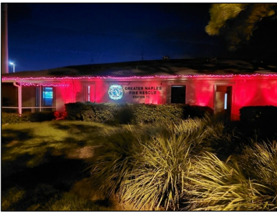
Station 70 participating in the Nation Fallen Firefighters Foundation “Light the Night” tradition.

The deaths were evenly split as to the type of duty. Of the total deaths, 51% occurred during an emergency, and 49% occurred during a non-emergency, such as training, administrative activities, performing other functions not related to an emergency incident and post-incident fatalities. Another major finding of the report was the cause of fatalities. Of the 82 overall deaths in 2018, 37 were due to stress or overexertion.