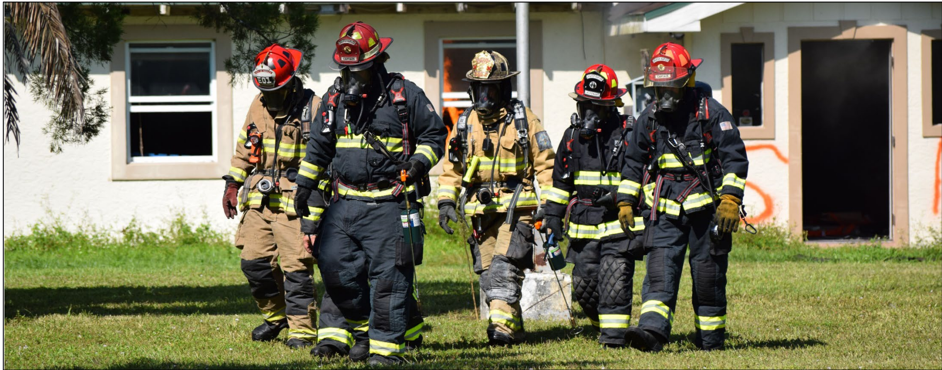
Firefighters leaving a training burn site.

Through it all, the Fire District Staff stands ready for what 2021 will bring. The GNFD members continue to perform in an exemplary manner, meeting these demands while providing exceptional customer service.