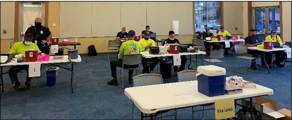
Paramedics administering COVID-19 vaccines at the South Regional Library.