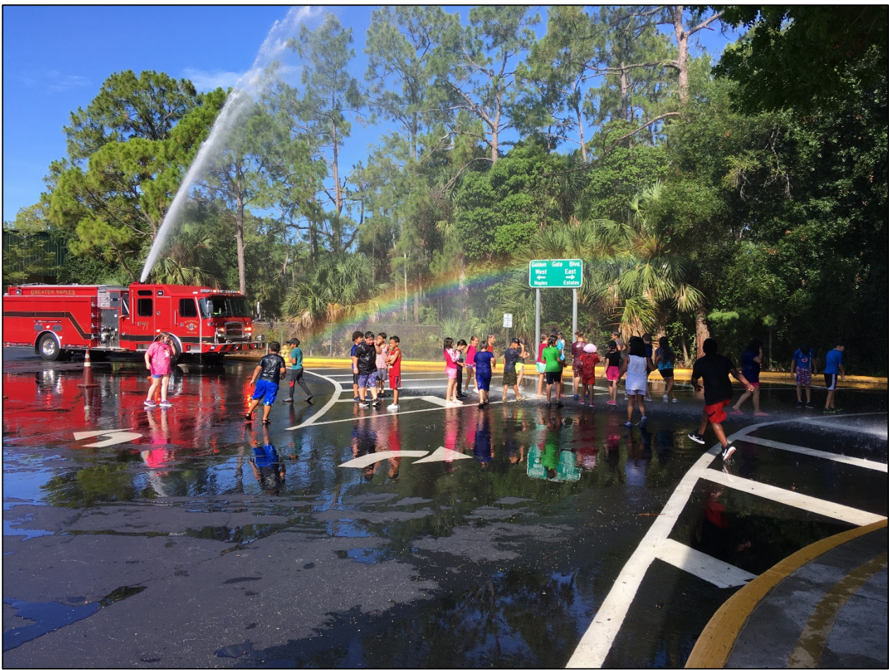
BCE students splashing around in the water from Engine 71 amidst the summer heat.

It’s no surprise that the tradition of “Water Day” at local schools is a student favorite. On this day, students get to enjoy an afternoon full of different water activities to cool off from the summer heat. Crews were thrilled to be part of Big Cypress Elementary water day, on June 9 th , where 900 students got to splash around under the rain from Engine 71. After the day was over, crews returned with beautiful letters from BCE students, thanking the firefighters for coming. Thank you to the individuals who helped provide such a fun afternoon for these well-deserving students!