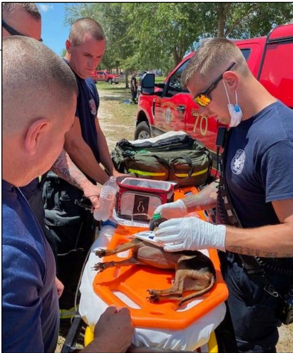
Crews working with EMS to resuscitate a Chihuahua that was involved in a house fire.

their own. It's important to weigh the magnitude of a situation in order to ensure everyone's safety. Rescuing animals trapped in a fire should be left to the professionals. The pet Chihuahua pictured on the right was saved from a house fire in April. Firefighters and EMS used pet oxygen masks that were donated by the Verona Walk Community to treat this puppy and expel any smoke from his lungs. Pet oxygen masks are used to resuscitate animals by offering a continuous and accurate direct flow of pure oxygen, making recovery quicker and more effective. The rubber seal at the base of these masks forces the mouth shut and delivers the oxygen directly into the nostrils. Having the right equipment on hand is vital to resuscitating pets from smoke asphyxiation. We are extremely grateful for donations like these that are put to great use!