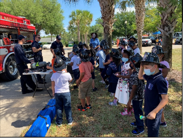
Bridge Prep Academy students gather for a safety lesson from firefighters.