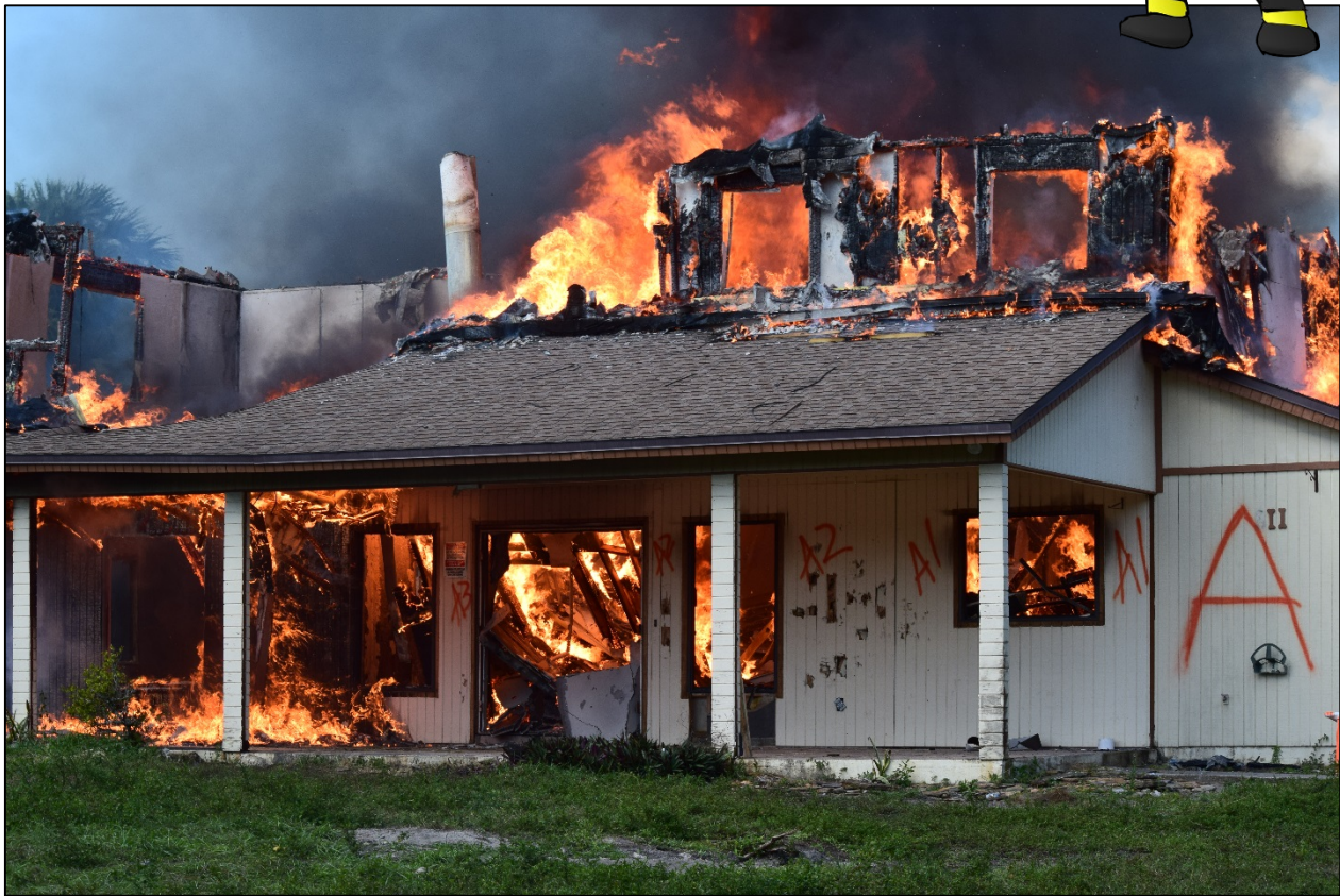
The final burn at acquired structure off Vanderbilt Beach Road.

The Collier County Expansion Program to expand Vanderbilt Beach Road provided the District with an opportunity to conduct 3 days of Live Fire Training at an acquired structure provided by the County. The District invited other agencies to participate and educate in conducting 27 burns over the 3-day span. Assistant Chief Andy Krajewski of Training and his team were able to provide training on fire behavior with the use of water cans as well as putting out fire with new piercing nozzles. They also took advantage of having multiple staged fires in each room allowing each firefighter to get continued training in the event of a Structure or Contained Fire.